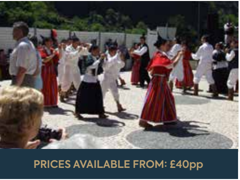
PRICES AVAILABLE FROM: £40pp

Depart up to Monte to visit the twin-towered 'Church of Our Lady of Monte'. Then get to experience one of the ancient means of transport in Madeira, the famous taboggan ride down the hillside. The tour continues to Eira do Serrado for incredible views over 'Nun's Valley'. Then visit this small village situated deep in an extinct crater not far from the highest peak of Madeira and enjoy tasting a local speciality liquor, Ginja, before returning to Funchal.