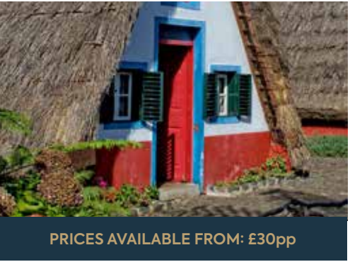
PRICES AVAILABLE FROM: £30pp

* Comfortable clothing and adequate footwear advised for the 1-hour walk