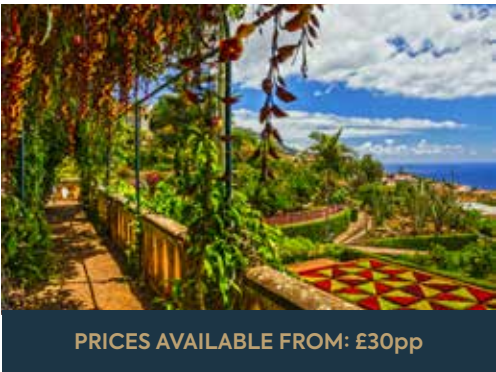
PRICES AVAILABLE FROM: £30pp