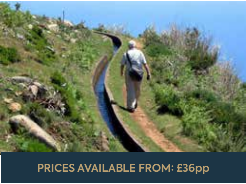
PRICES AVAILABLE FROM: £36pp

*After lunch, possibility to swim (weather permitting)