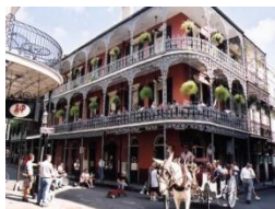
02 nights New Orleans