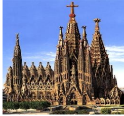
01 night Barcelona