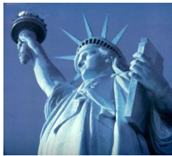
02 nights New York